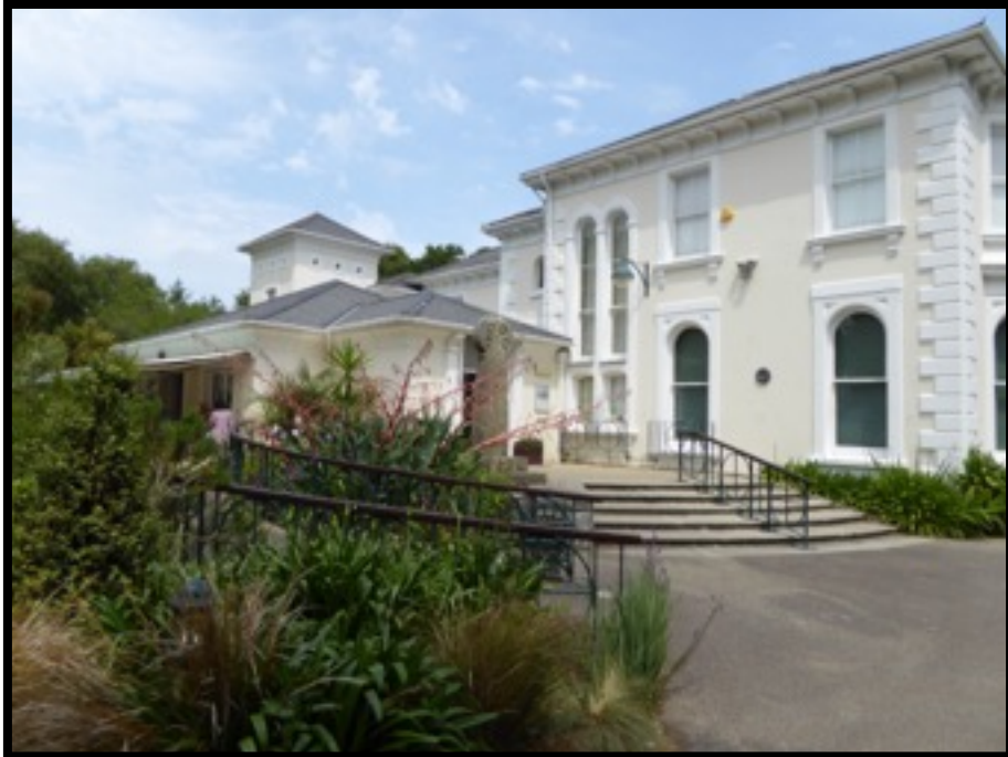
The Penlee Gallery

It was a delightful visit and the staff were really welcoming and even provided us with an excellent cream tea.