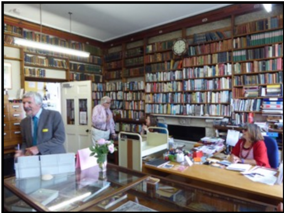
The Reception Room at the Morrab